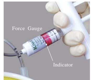
2 Indicator moves along gauge giving a force reading.